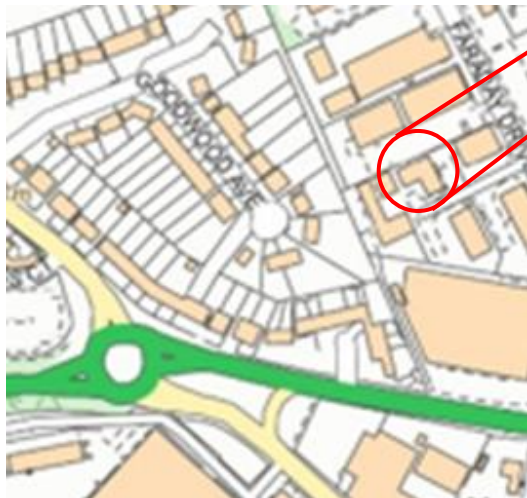
Progress House, Churchill Court, Bridgnorth, WV15 5BA